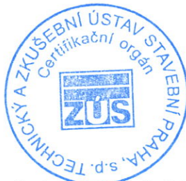
The stamp of the Certification Body

This Annex is an integral part of the certificate No. 040-079247